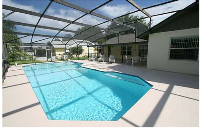
34ft heated pool