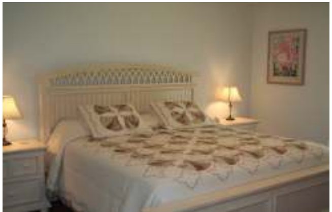
The Master Bedroom