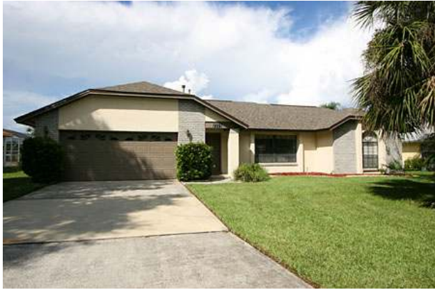
Indian Ridge, Kissimmee